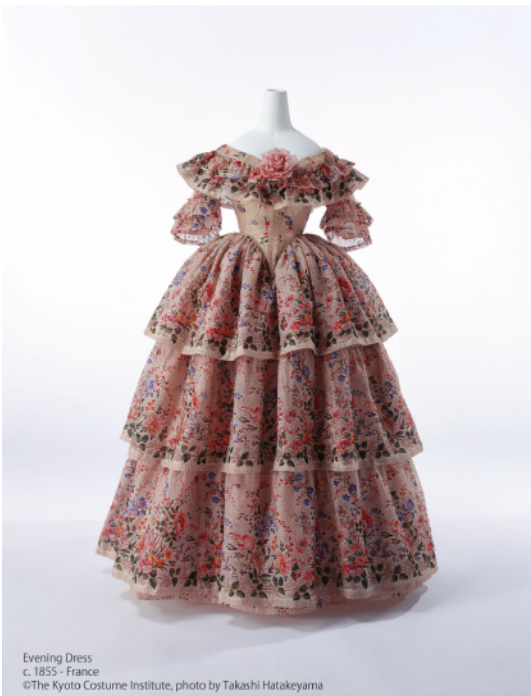
Evening Dress c. 1855 - France