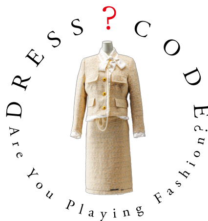
From top to bottom on front page: Left=●COMME des GARÇONS, Spring/Summer 2018 (also above left picture on back page) ●beautiful people, Autumn/Winter 2017 ●MOSCHINO, Spring/Summer 2017, gift of MOSCHINO S.p.A. (above right, back page) ●KOCHÉ, Spring/Summer 2018 (bottom left, back page) ●Michelangelo Pistoletto (Venus of the Rags) 1967 Collection of Toyota Municipal Museum of Art, (bottom center, back page) (*) Center=●GUCCI, Autumn/Winter 2018. Right=●CAMPBELL'S SOUP COMPANY, 1968 ●Jeff Koons×LOUIS VUITTON, 2017 (above center, back page) (**) ●COMME des GARÇONS HOMME PLUS, Autumn/Winter 2009 ●Vetements, Autumn/Winter 2017 (bottom right, back page) ●FENDI, 2018. Collection of the Kyoto Costume Institute except for (*), except for (**)(**)